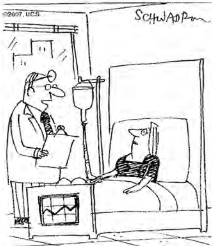
"We've upgraded your condition from 'critical' to 'costly.'"